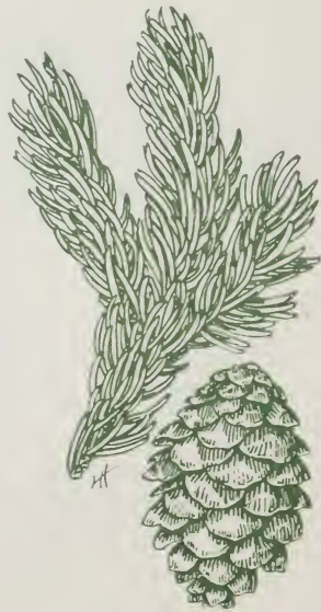
Red spruce. (About two-thirds natural size)